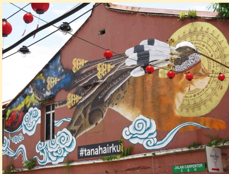
"Jumping Feline": street art in Carpenter Street, Kuching