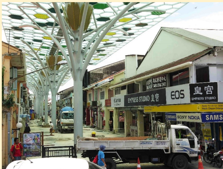
07/04/2016. Still under works: India Street's large new steel and glass arcade (Kuching)