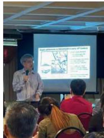
Talk on Padungan to certified tour guides From Sarawak Tourist Guide Association

In order to strengthen the bonds with and between our members, we had an SHS Members' Night event on 7 th Aug 2022 at the Telang Usan Hotel. It was an evening of good conversation, good food and good fellowship.