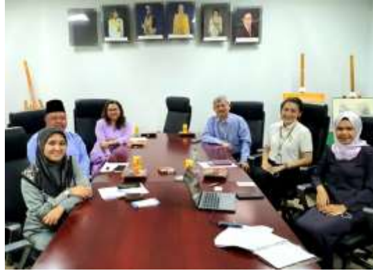
Met with staff of Pustaka Negeri Sarawak (from Sarawak Record Repository), to discuss storage and archival of documents and small heritage artefacts