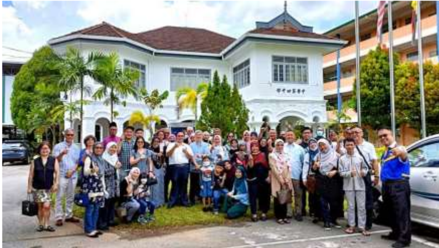
Heritage site visit: Darul Kurnia (Oct 2022)