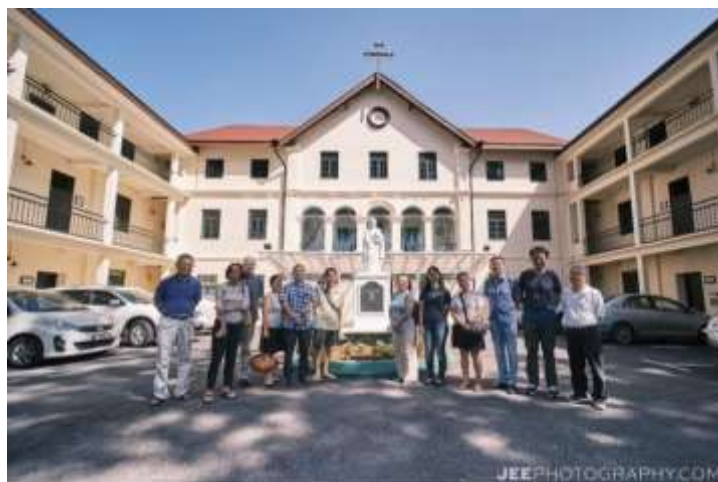
Heritage site visit: Mill Hill Block, St Joseph’s School (Jul 2022)