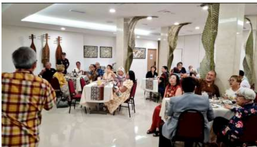
Animated conversation happening at SHS Members' Night (Aug 2022)