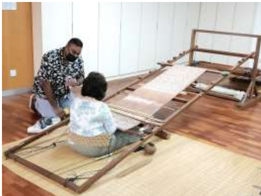
Visitor from National Heritage Board (Singapore), hosted to Tun Jugah Foundation

Gave a two-hour talk to some fifty certified tour guides, members of the Sarawak Tourist Guide Association on 24 th November 2022.