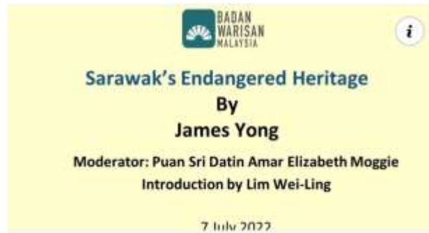
Zoom talk for Badan Warisan Malaysia (July 2022)

On 7 th July 2022, SHS President delivered a well-received talk on “Sarawak’s Endangered Heritage” as part of Badan Warisan Malaysia’s ‘Spotlight on Sarawak’ (#toksarawak). There were around 135 participants.