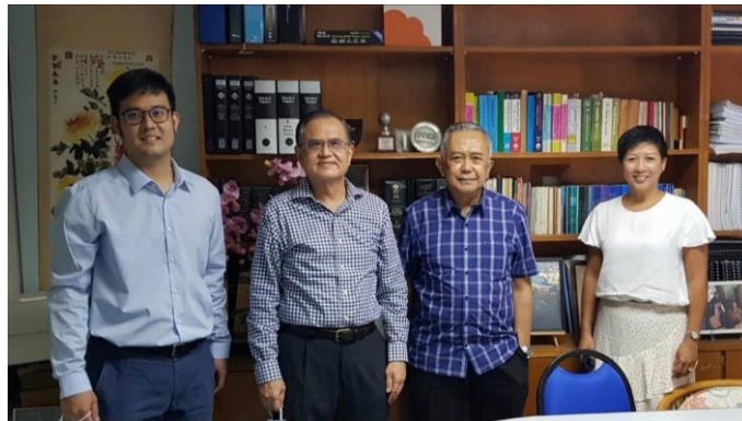
SHS meeting auditor Richard Kiew & Co.

[for details, see the audited Financial Statements report]