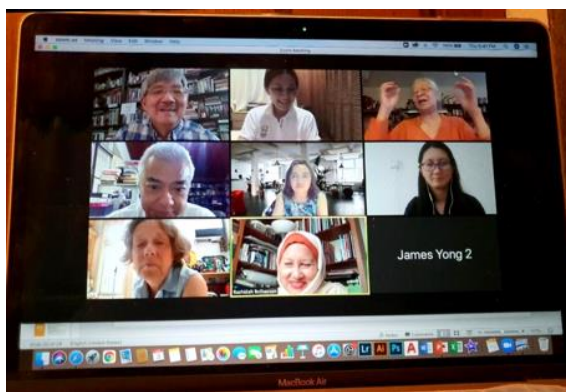
ICH 1st roundtable discussion via Zoom - 3 rd June 2021

Underway is another project to develop a second booklet in our “ Vanishing Trades ” series, tentatively titled “ The Blacksmiths of Kuching ”. A photoshoot has been carried out at one of the remaining blacksmiths, originally from Blacksmith Road, now in Bintawa. Research and writing is in progress.