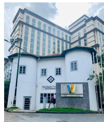
Waterfront Hotel signage in front of Round Tower building

Upon observing works being carried out on Kuching's Round Tower, a gazetted heritage building, we learnt that the Government had granted the use of the building to a private entity for a repurposing as a café/restaurant. SHS formally expressed concerns to the Ministry of Tourism, Arts and Culture, to the Sarawak Museum Department and to the tenant company, not on the repurposing in itself, but on the heritage insensitiveness of some of the renovation works. It appeared that no permit had been granted by the Sarawak Museum Department for the renovation works as is required by the Sarawak Heritage Ordinance for listed buildings. The works nevertheless proceeded.