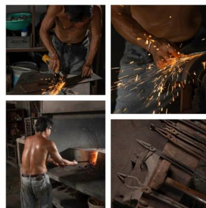
Vanishing Trades - The Blacksmiths of Kuching