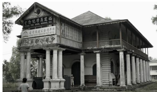
The Old Hokkien School

YHO: We have in-principle approved a proposal for a brief engagement exercise with students of a sample of three schools to better understand their perceptions of heritage, to provide us with better insights on how to increase awareness of heritage among young people. The implementation of this exercise is subject to the reopening of the schools.