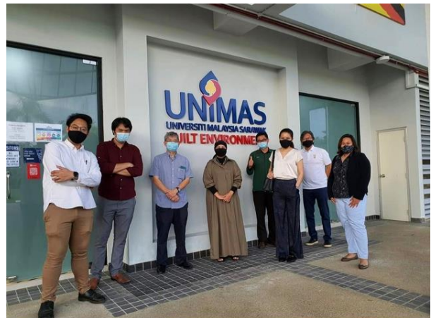
Image above: 31 st March 2021, SHS and UNIMAS MOU meeting at Faculty of Built Environment