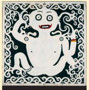
Berawan 1955 exhibition 1953, Berawa artisti forn long legan on the Trijar River were consensed by the Jahman Hunson to part of the growth for exhibiting the series of the series of the series of the exhibiting the series of the series of the series of the exhibiting the series of the series of the series of the series of the series of the series of the series of the series of the series of the series of the series of the Series of the series of the series of the series of the series of the series of the series of the series of the series of the series of the series of the series of the series of the series of the series of the series of the series of the series of the series of the series of the series of the series of the series of the series of the series of the series of the series of the series of the series of the series of the series of the series of the series of the series of the series of the series of the series of the series of the series of the series of the series of the series of the series of the series of the series of the series of the series of the series of the series of the series of the series of the series of the series of the series of the series of the series of the series of the series of the series of the series of the series of the series of the series of the series of the series of the series of the series of the series of the series of the series of the series of the series of the series of the series of the series of the series of the series of the series of the series of the series of the series of the series of the series of the series of the series of the series of the series of the series of the series of the series of the series of the series of the series of the series of the series of the series of the series of the series of the series of the series of the series of the series of the series of the series of the series of the series of the series of the series of the series of the series of the series of the series of the series of the series of the series of the series of