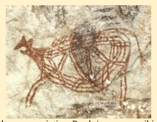
Gua Tambun cave painting, Perak

Conservation plan for Tambun Cave, Perak - Gua Tambun, located near Ipoh, has over 600 forms of rock art, estimated to be 2000 to 5000 years old. The State Government has recently finalized a conservation plan for the site, and facilities to protect the site and to improve visitors access will be built under a collaboration between the State and National Heritage Department, reported The Star online. Gua Tambun is the largest rock art site in peninsular Malaysia. The paintings were gazetted by Ipoh City Council in 1986 and declared a national heritage by the Department of National Heritage in 2010. They have been exposed to the elements and prone to vandalism. The Centre for Global Archaeological Research of USM (University Sains Malaysia) has contributed to research the site and to community-based heritage awareness projects. ["Working to save Tambun Cave" The Star online, 8 March 2016; tambunrockart.com].