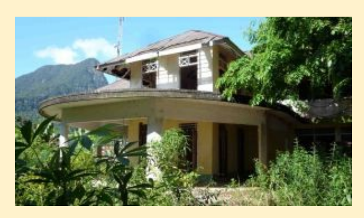
Ex-Government rest house, 'Wallace point', Santubong, (SHS photo, 2013). The beautifully located site has an indisputable heritage value as a result of its historical association to Wallace.

tourism master plan, he recalled the project to establish a "Wallace Centre" in Santubong, based on a rehabilitation of Santubong's ex-Government rest house. The centre would be "another avenue for Sarawak to attract researchers and scientists", he said, reported the Borneo Post. The late colonial-era building is currently dilapidated. It is known to sit on the plot of the original bungalow built for James Brooke, where the naturalist Alfred Russel Wallace stayed in 1854/55. It is there that he wrote the paper that became known as the "Sarawak law" in which he figured the theory of evolution slightly ahead of Darwin's writings on the subject (*).