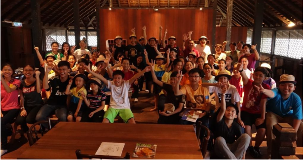
The most outstanding team rewarded for their effort.