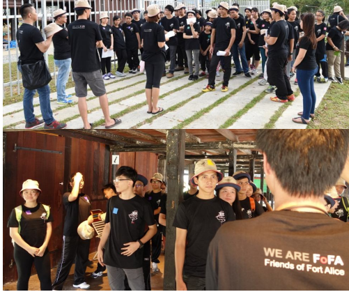
Registration and briefing.

After a short briefing on housekeeping matters, all attendees started the day by cleaning the interior and compound of Fort Alice in preparation for its official opening on 18.04.2015. The cleaning mission was accomplished ahead of time, most likely because the attendees wanted to sleep in a clean and comfortable environment for the night. They were rewarded with home-made pie and 'kuih' before the traditional games session.