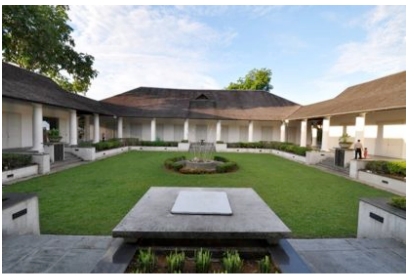
Figure 4. A view of the courtyard of the Old Kuching Courthouse after the completion of the conservation and adaptive reuse works. These landscape works, while not strictly in accordance with the 1945 landscape, are separate from the building conservation works.

where we convinced BOMBA that belian , which is not found in West Malaysia, in the sizes in which it was employed in the Courthouse, was able to withstand collapse in a fire for one hour.