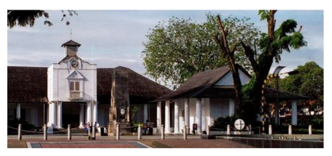
Figure 1. View of the front Old Kuching Courthouse after the completion of the conservation and adaptive reuse works, and conservation