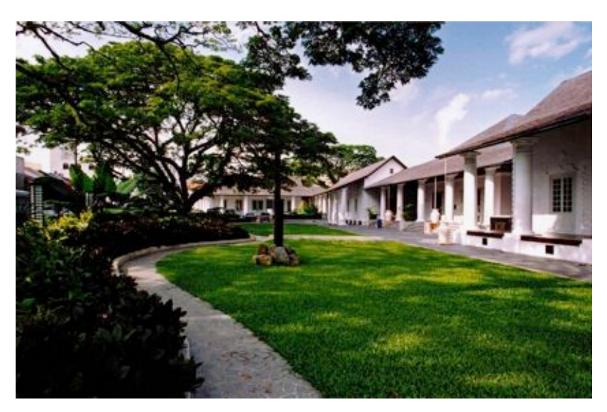
Figure 3. View of the Old Kuching Courthouse from Jalan Tun Openg after the completion of the conservation and adaptive reuse works.

previously. The council, on the other hand, insisted that they are only empowered to enforce the Building Ordinance, which regulates building issues only. While this might have meant that LCDA approval could be sidestepped, the danger was that the 'guidelines' could be re-enforced at any time, possibly adding delays that we could not afford. Our approach was to conform strictly to the LCDA's guidelines and to approach them directly to seek their written approval, which they gave to us. Armed with that, we delivered the letter of conformity with the guidelines to the council to allow them to continue the approval of the building plans.