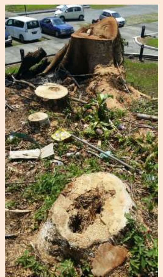
The size of the felled trees gives an indication of their age

She went on to say: "It seems as though these kinds of decisions are taken at random without any proper consultation of an appropriate range of agencies or even a systematic basis for decision making in place. How can we leave such significant decisions involving a RM5 million project and the heritage of an entire community up to the whim of a handful of workers in the Resident's office of Sri Aman? It is inconceivable that they should have felt it appropriate to act so extremely against the wishes of the conservation expert on the project. The damage done to the setting of this historic site will not be put right for decades at the very least."