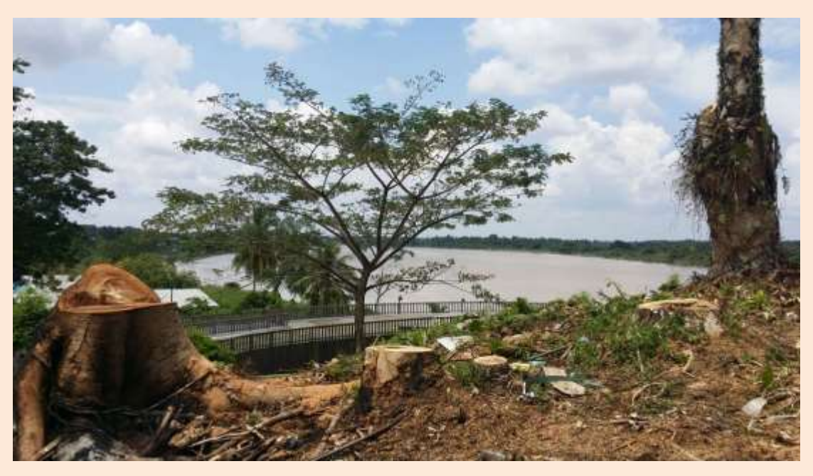
The scene of destruction

Therefore, the Society are asking the Chief Minister to put preservation of heritage on his much welcome new agenda of reforms. Renowned to be a great student of history, SHS calls on him to send a clear message to his various departments that the preservation of the State's heritage is indeed a priority by instating a heritage unit that will be tasked with its protection and giving it the teeth to function effectively.