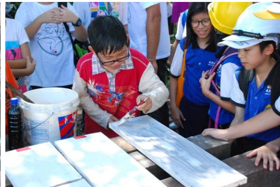
A participant applying lime wash onto one of the test panels.

As the claddings are to receive traditional white lime wash coating, belian has to be seasoned to remove its red staining sap. Traditionally, the timber is submerged in water for prolonged periods, or left stacked in the open to deplete the staining sap. However, due to time constraints, the seasoning process is required to be sped up, thus the experimental boiling. The timber is placed in a water bath and boiled for 4 hours.