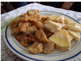
'Cucu sayur' (L) & 'Cucur Sukun'(R).