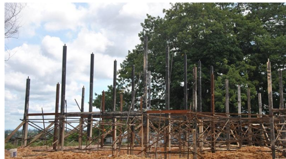
Site progress as at 19.11.2013.