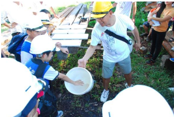
A participant intrigue by the heat emitted after adding water to lime powder.