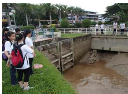
Floodgates shows where river mouth of Sungei Simanggang used to be.