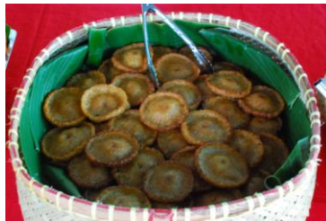
Penyalam (flour with palm sugar).