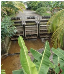
Sungai Stawang - 'Red River'

After the bridge, the entourage paused at the junction of Jalan Stawang where the participants were taught to observe the life in the place that they are visiting. The facilitators helped to identify herbs vegetables and fruit that they ate from the gardens around kampong houses. It was the first time for many participants to see 'Dabai' (local black 'olive' believed to belong to avocado family).