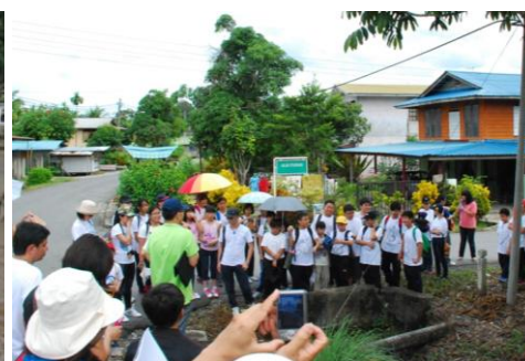
Jalan Stawang is known as the "deities route" by local Chinese community.