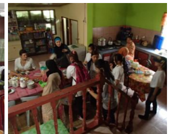
Afternoon tea in the kitchen