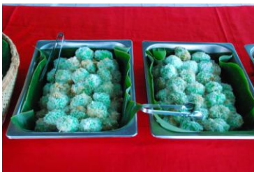
Palm sugar and coconut kuih.