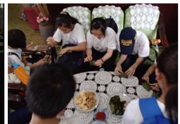
Enjoy hospitality of house owner.