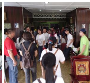
Participants mingling with house owner.