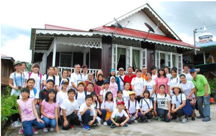
Group photo at traditional Malay house.

Our hosts also treated the participants with homemade delicacies like kuih bakul (palm sugar with steamed glutinous flour wrapped in banana leaves), and 'Cucu sayur'(vegetable fritter) and 'cucur sukun'(deep fried breadfruit). Before departing for the adjacent Surau, Mr Goh presented the host family with a certificate and a token of appreciation, followed by a group photo taken in front of the house.