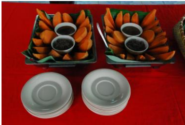
Sweet tapioca with belacan (fermented shrimps) and palm sugar dip.

As an end note, a spread of local delicacies was served. As it was getting dark, the trip to the traditional Malay burial grounds had to be postponed.