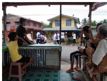
Watching time pass.