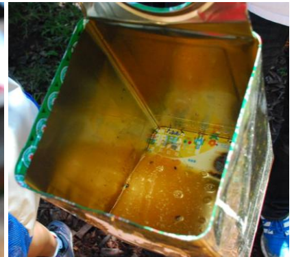
Oxhide granules melted in hot water turns into glue.