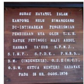
Plaque on the Surau wall.