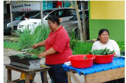
Food stall encourages social interaction between public and private spaces.