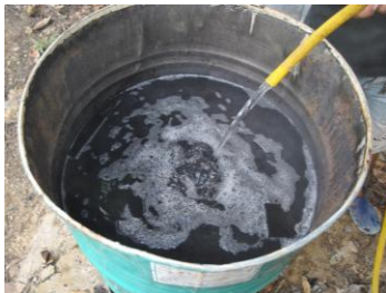
Preparing to boiling the Belian.

As the claddings are to receive traditional white lime wash coating, belian has to be seasoned to remove its red staining sap. Traditionally, the timber is submerged in water for prolonged periods, or left stacked in the open to deplete the staining sap. However, due to time constraints, the seasoning process is required to be sped up, thus the experimental boiling. The timber is placed in a water bath and boiled for 4 hours.