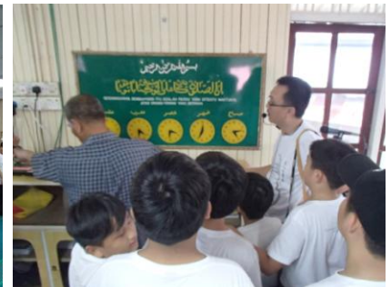
Interior views of the prayer hall.

Prayer mats neatly lined up with long side facing 'Kiblat' direction (L); A timber screen segregate the female praying area behind male (C); and explanation on how the 5 five clocks are used to determine the five prayer sessions daily.