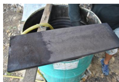
Belian turned black after boiling