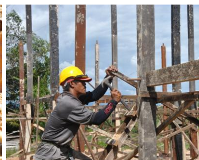
Erection of column and adjusting the verticality of the column.