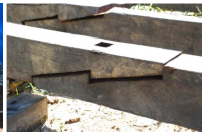
Splicing detail of new and old belian.