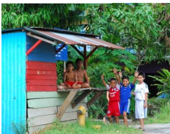
A shed for business is also for play; the road is also a running track. Reminiscing the old days diminishing in the footsteps of urbanization.