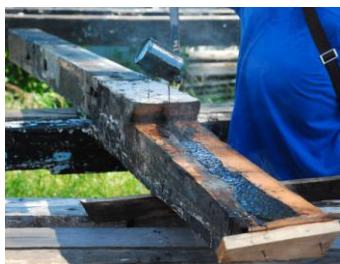
Sealing crevice in old belian with tar.