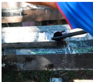
Sealing the joint with tar.