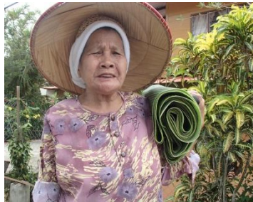
Collecting banana leaves for cooking.