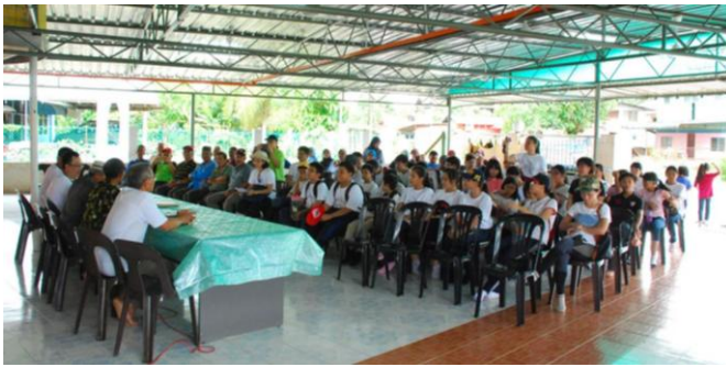
Briefing session at the extended front terrace of Surau.

The Surau was adjacent to Hajah Zaleha's house. The Committee members of the Surau greeted the participants and gave a briefing on the history and functions of the place. According to Haji Ibrahim Arriffin, apart from its religious function, the Surau is also a community gathering place where cultural and communal activities are held. The original building was a simple building with "kulit kayu putih" as timber frame, clad with bamboo as walls, and covered with "atap" roofing. At that time it served only had 16 houses, where the community were farmers. The building required regular renovation due to the perishable materials used in construction and expanded as the population of the kampong grew. The current form was the result of a major renovation carried out in 1974.