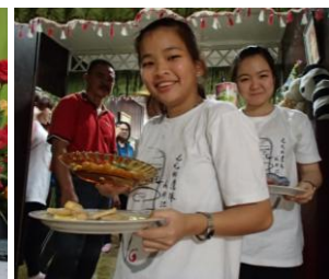
Good helping hands.