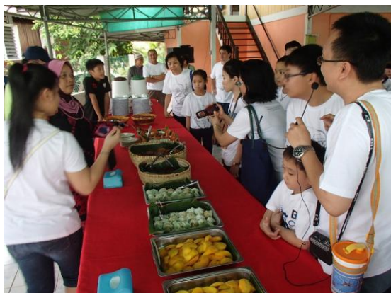
The food caterer explained how the dishes were prepared.