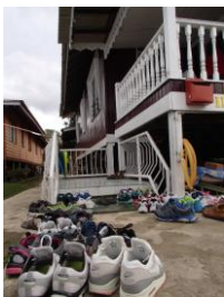
Shoe off before entering.