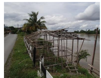
Makeshift accomodation by visitors themselves during Pesta Benak.