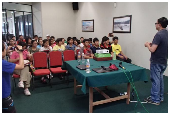
Attendees of the awareness workshop listening intently to their preliminary briefing.