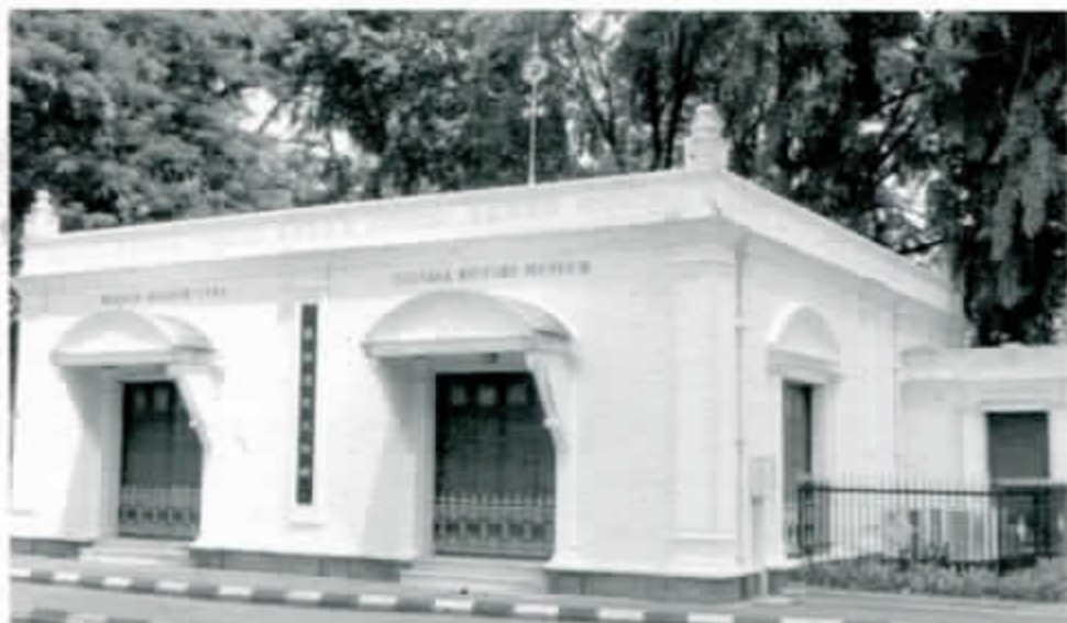
Chinese Chamber of Commerce, Kuching 1912