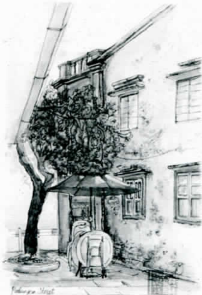
Pedangan Street 14 Dec 2014