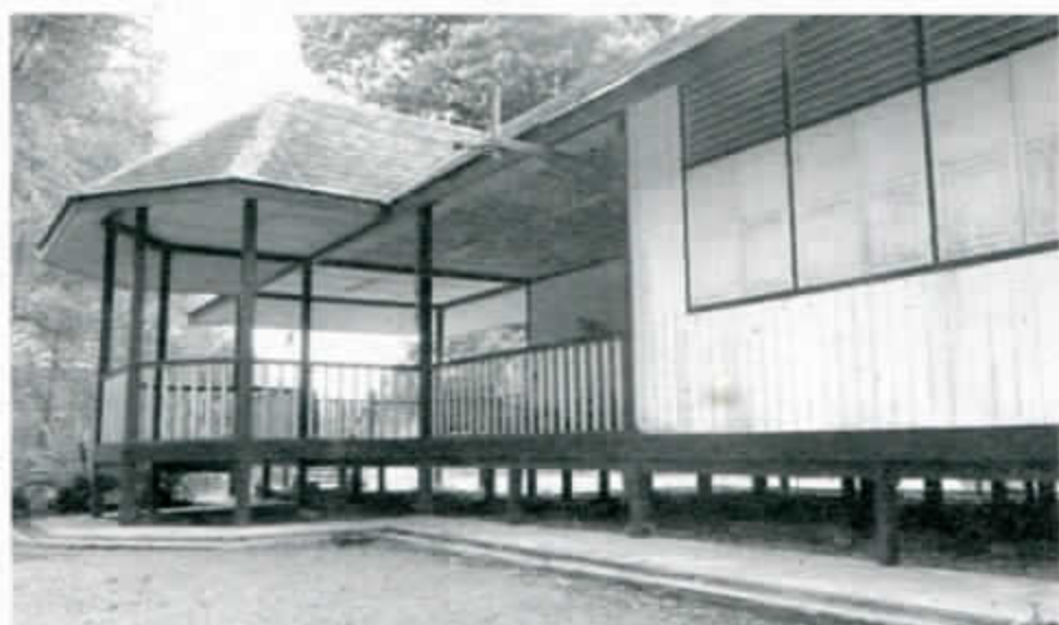
Segu Bungalow, Kuching 1936