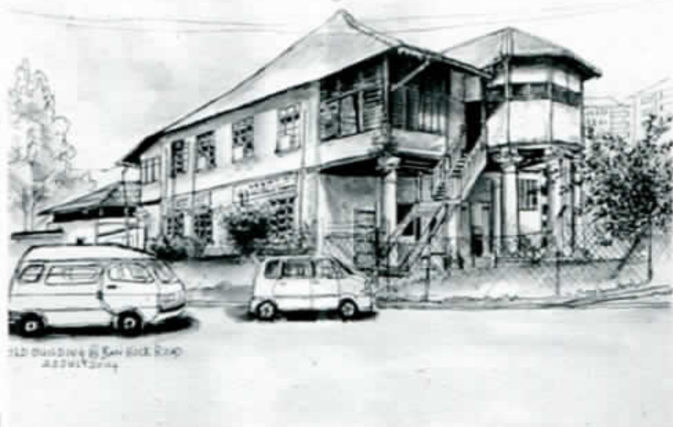
OLD BUILDING @ KEM HOCK ROAD 22 JULY 2014