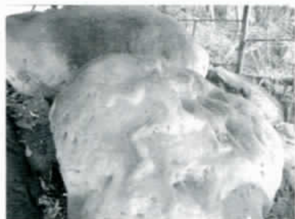
Batu Gambar, Sungai Jaong