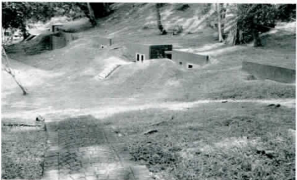
Air Raid Shelter, Park Lane, Kuching, 1940