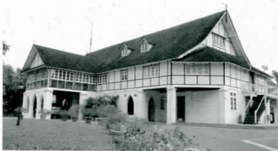
Bishop House (S.P.G), Kuching 1848