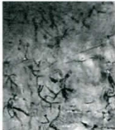
Gua Sireh, Serian, Samarahan