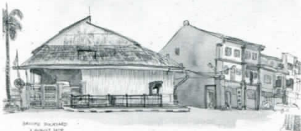
SHAWING COURTYARD 2 AUGUST 2019