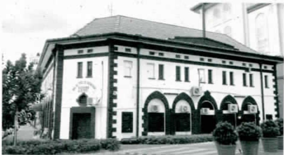
Sentral Police Station, Kuching 1931