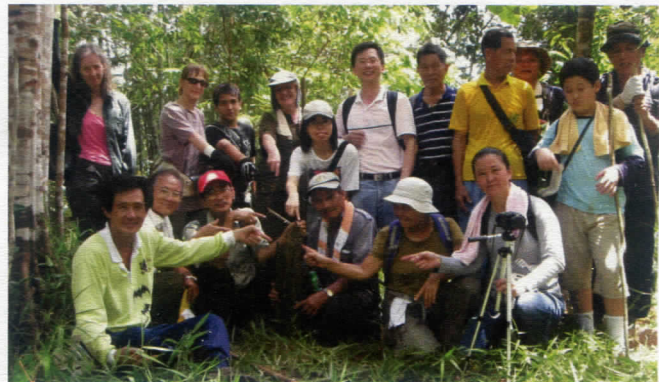
Group picture of the various members of SHS and MNS during the expedition.