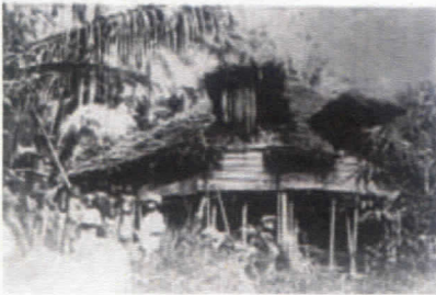
Land Dayak Headhouse, Peninjaw

Wallace wrote in his book 'The Malay Archipelago' (1862) that he spent 3 weeks (Dec 1854) in James Brooke's retreat "for the purpose of making a collection of land - shells, butterflies and moths, ferns and orchids."