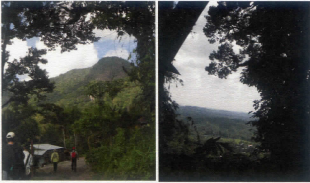
(Left) View of Mount Serembu from the bottom. (Right) View from the top.

SHS members went on an expedition to Mount Serembu (Gunung Muan) at Peninjaw with the Siniawan local community on September 2009. A second trip was co-organised with Malaysian Nature Society (MNS) on 18th April 2010.