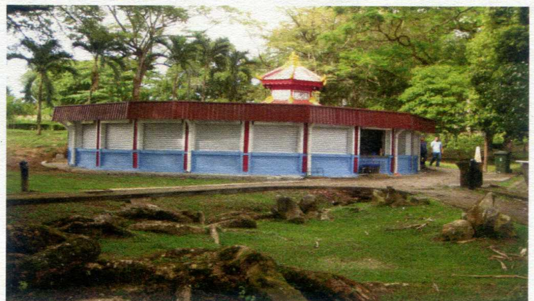
The Chinese Summerhouse after recent renovations. (December 2010)