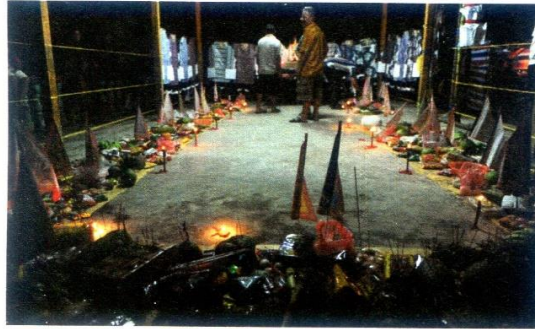
Ceremonial offerings in front of Liew Shangpang Temple during the Hungry Ghost festival, put out by the sub-community consists of 25 Chinese families.

This community project could become a template to other communities who wish to follow in the footsteps of Siniawan.