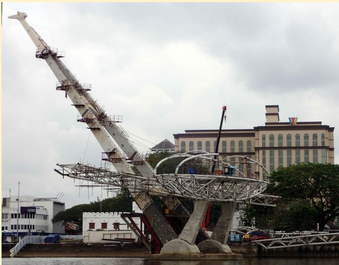
It's not a crane: the rising Golden Bridge. Can you spot the Square Tower and the Clock Tower of the Old Court House? (03/2017)