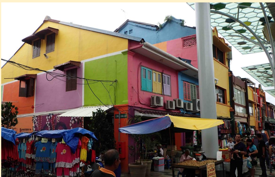
More colours: India Street, Kuching. (03/2017)

An ode to Kuching heritage buildings: “Kuching’s wonderful architecture” is the title of an article published by The Star further to a visit of the Kuching Heritage Trail by the Sarawak Assistant Minister in charge of tourism. [ The Star online, 17 Jan. 2017 ] It is worthwhile recalling here that the Sarawak Heritage Society was instrumental in the development of the Kuching Heritage Trail in 2007.