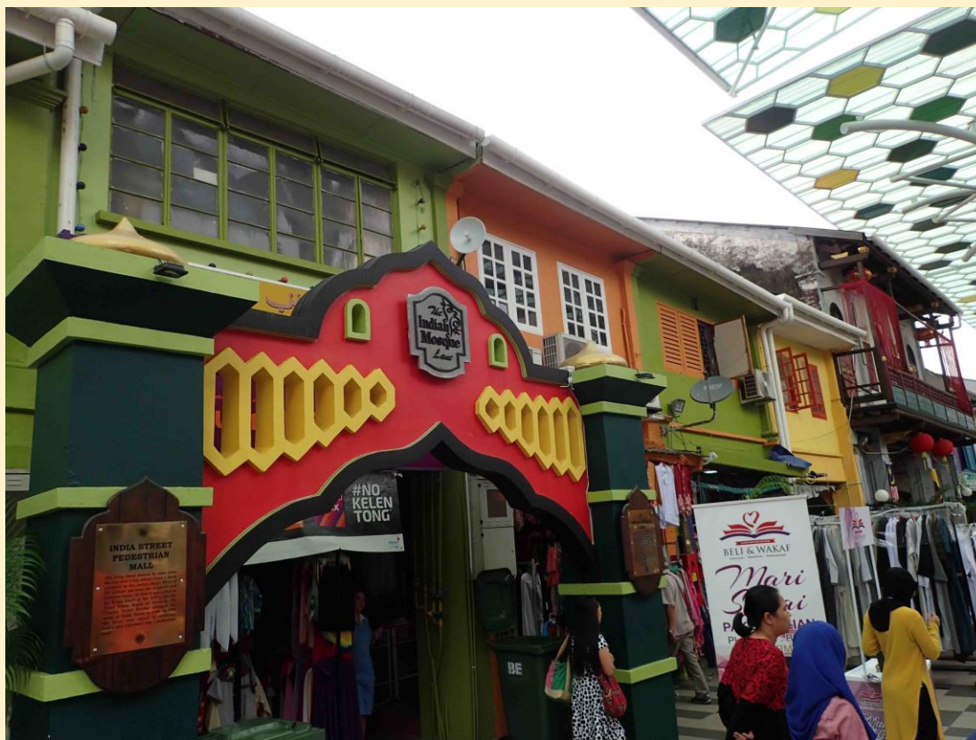
India Street. Colored. (03/2017)