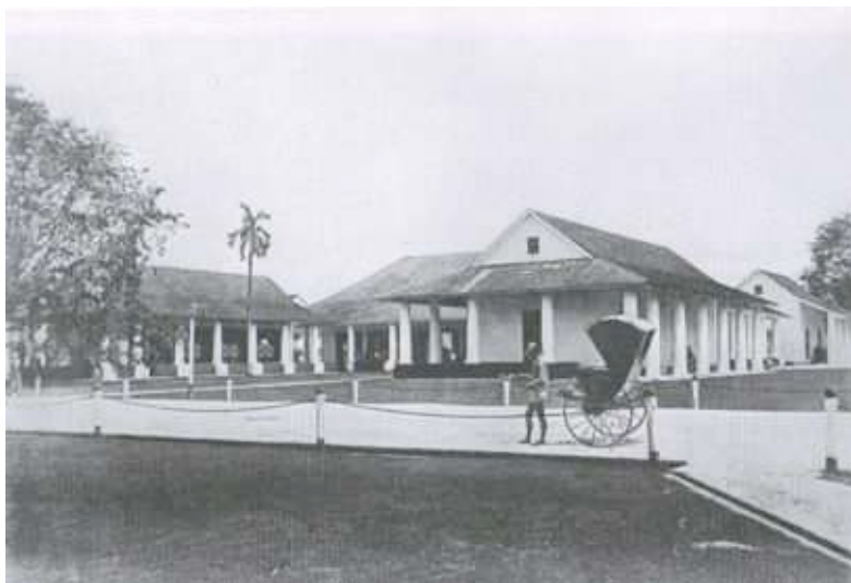
Figure 5. View of the rear of courthouse after the second renovation. The photograph was taken between 1900 and 1905, when the photographer left Sarawak. 35

Museum (1891), which demonstrated the government's commitment by aiming to be 'the most expensive permanent edifice in Borneo...'. 34