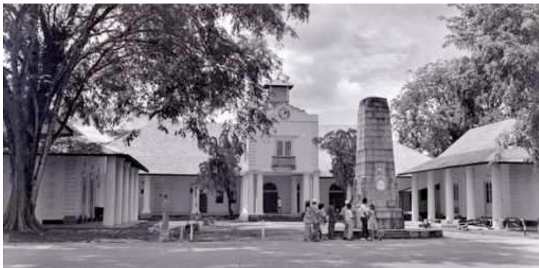
Figure 4. View of the front of the third courthouse in the 1970's. The first wing (1874) can be seen behind the clock-tower and the side wings, which were built in 1883. The Rajah's Memorial in the foreground was built in 1924.

construction to the first wing, although they were narrower. This narrow format was the basis for the design of the next two wings, as were the attached roofs (but unattached rooms.) 29 The spaces vacated in the first wing were modified to provide spaces for the remaining functions there to expand into. These works represent a willingness to invest in public works that was not always seen during the reign of the first rajah. This growing confidence in Sarawak's permanent survival and success accompanied a time when Sarawak's accounts were beginning to return a profit.