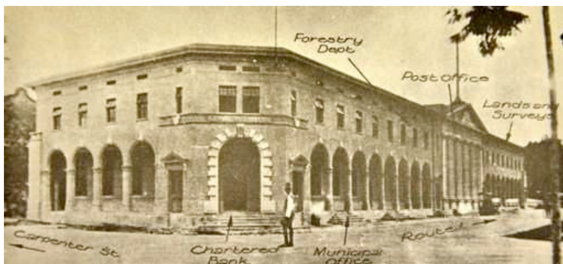
Figure 8. View of the new Government Offices, across the road from the courthouse complex. 42

unique character of Sarawak's government set up by the first rajah. The courthouse's fourth extension (in 1927, for Sarawak's treasury) demonstrates this approach in built form. It was located across a side street and not attached to the main courthouse complex, but it followed the tradition of courthouse extensions being built to the same design as the original 1874 wing. While its design and proportions were essentially 50 years old, its construction was thoroughly modern, with reinforced concrete piles and structural frame being used. The construction technology of the floor was the most modern, as it was a prefabricated system of T-section reinforced concrete planks, which allowed for faster construction and less construction elements.