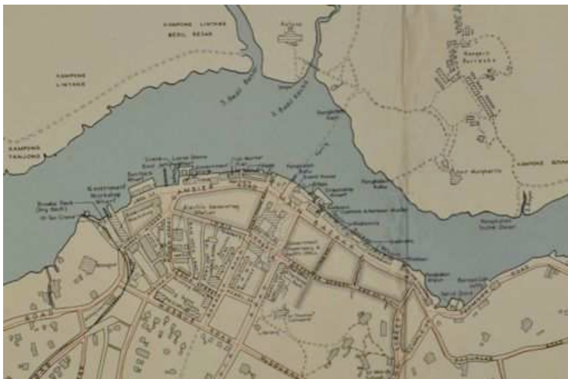
Figure 9. Part of a map of pre-WW2 Kuching from 1945. The courthouse is in the centre of the map, with the Astana directly to its north. While it has named the kampungs north of the river, it has left out the actual kampung houses. 43

laid out according to western surveying practices, and ordered by gridded road patterns. Towards the end of Brooke rule in Sarawak, many of its urban spatial practices were approaching that of more conventional British colonies in Southeast Asia. However, by then, the principles that contrasted with conventional colonialism, (established by the first rajah, James Brooke, had been well established), and were to go on to affect the development of settlement patterns and urban morphology in Sarawak to the current day.