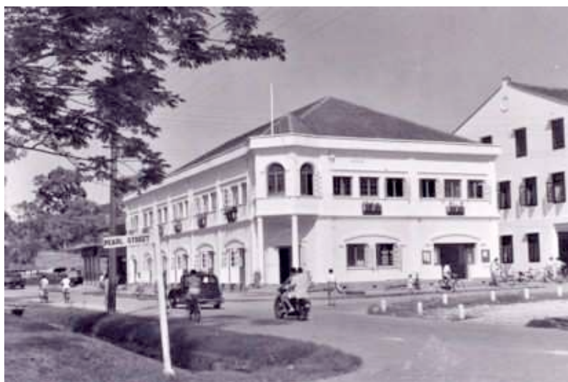
Figure 6. The Government Printing Office (1914) in the 1950's.