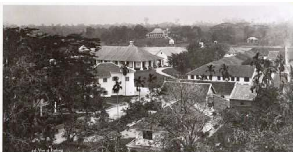
Figure 3. Figure 3. View of the rear of courthouse after the first renovation – one of the new wings and the top of the clocktower can be seen behind it. The photograph was taken sometime between 1883 and 1905.

sun shading and protection from the heavy rain. The floors and roof were constructed of belian timber, with belain shingles used as the roofing. The government newspaper, The Sarawak Gazette, (undoubtedly supervised by the rajah,) recognised that ‘it has been pronounced by all to be a very handsome plain building suitable for the purpose; if boasting no [colonial or western] architectural beauties, it is free from blemishes and is not an eyesore’, and went on to rationalise the unsuitability of buildings without eaves in Sarawak’s climate. 26 While ‘plain,’ the architecture of this first wing was to be employed in the four extensions of the courthouse complex over the next 53 years. The fifth extension was built by the Japanese during World War Two, likely in 1942. The seemingly seamless architectural transition from extension to extension (except for the Japanese building,) has caused many to hold the mistaken belief that the entire complex was constructed at the same time. 27