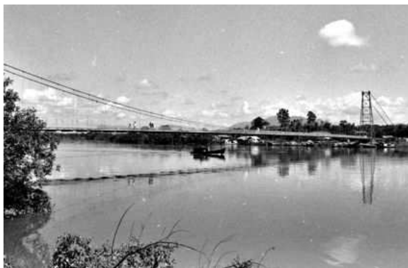
Figure 7. The Satok Suspension Bridge (1926) in the 1970's.

In 1924, the government of the third rajah constructed the 'Rajah's Memorial,' (see Figure 4), commemorating the rule of Charles Brooke, located in front of the courthouse. Although the monument's construction was implemented by the Public Works Department, this was the first publicly recorded time where an overseas architect (Swan and McLaren, Singapore,) was used to design a structure Sarawak. 40 The fashionably current art deco architecture of the monument contrasted with the tropical colonial architecture of the courthouse, perhaps indicating the differences in the approaches of the second and third rajahs. Unlike his father, he third rajah also encouraged high-tech solutions, such as the suspension bridge at Satok, opened in 1926 (Figure 7). 41 While his father had been suspicious of this approach, preferring a more conservative solution with large masonry pylons set in the river carrying the bridge, Vyner embraced it to spectacular modern effect.