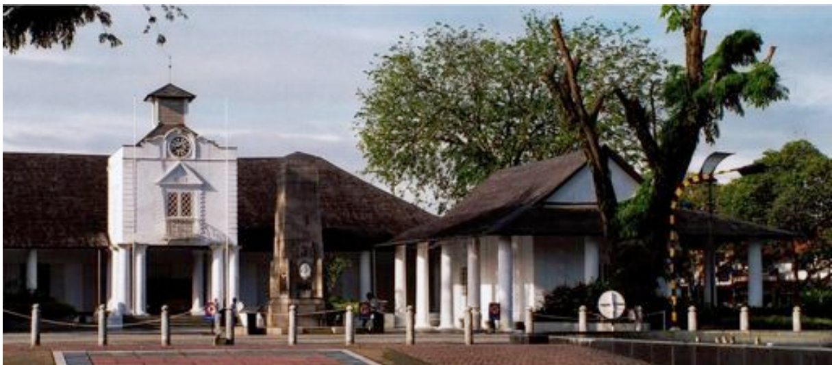
Figure 1. View of the front Old Kuching Courthouse after the completion of the conservation and adaptive reuse works, and conservation