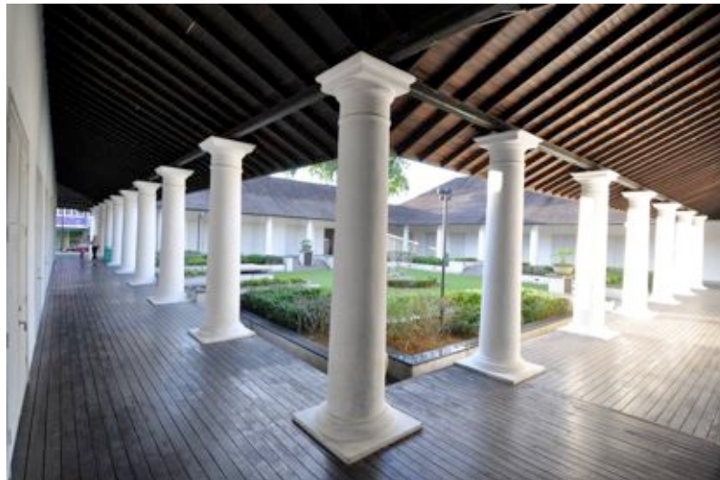
Figure 5 , View of the courtyard of the Old Kuching Courthouse after the completion of the conservation and adaptive reuse works

had bakau timber piles, a Borneo timber species that does not degrade when buried as piles. Block J had a reinforced concrete strip footing. Column footings, stumps, and load bearing walls were underpinned with micro-piles to prevent possible further settlement. New stumps were added to reduce the span of the existing bearers where necessary. All of the floor structure had belian bearers and joists, except for Block J, which had precast concrete planks, and a marble tile floor finish. The vast majority of the belian floor bearers were in good condition and were retained. In modern terms, some of the floors might have been considered to have too much vertical movement with the additional live loads anticipated, so additional belian floor joists were added. As the original floorboards and decking had been replaced or damaged beyond repair, the floors were restored with new belian ones.