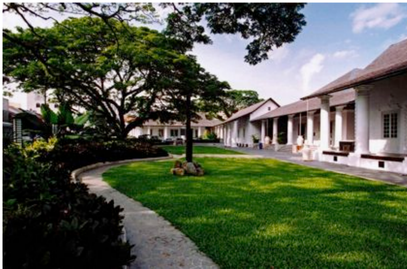
Figure 3. View of the Old Kuching Courthouse from Jalan Tun Openg after the completion of the conservation and adaptive reuse works.

previously. The council, on the other hand, insisted that they are only empowered to enforce the Building Ordinance, which regulates building issues only. While this might have meant that LCDA approval could be sidestepped, the danger was that the 'guidelines' could be re-enforced at any time, possibly adding delays that we could not afford. Our approach was to conform strictly to the LCDA's guidelines and to approach them directly to seek their written approval, which they gave to us. Armed with that, we delivered the letter of conformity with the guidelines to the council to allow them to continue the approval of the building plans.