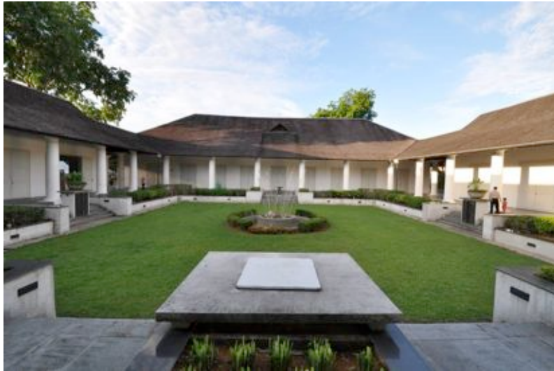
Figure 4. A view of the courtyard of the Old Kuching Courthouse after the completion of the conservation and adaptive reuse works. These landscape works, while not strictly in accordance with the 1945 landscape, are separate from the building conservation works.

where we convinced BOMBA that belian , which is not found in West Malaysia, in the sizes in which it was employed in the Courthouse, was able to withstand collapse in a fire for one hour.