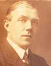
Charles Vyner Brooke